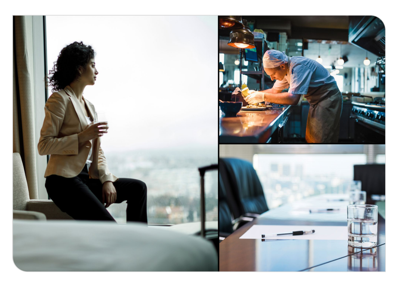
Version 5.7 • 19 November 2021 – 31 August 2027